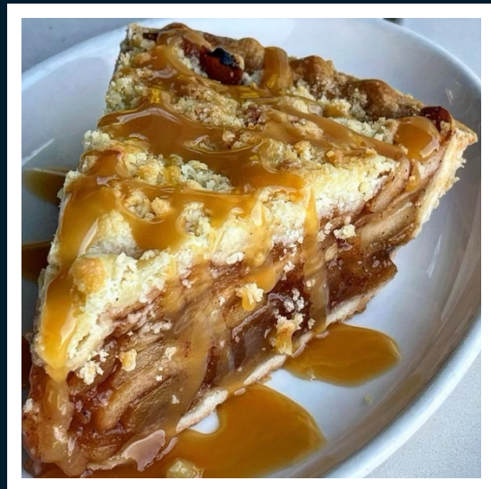
DUTCH APPLE PIE A LA MODE 10 Fresh Golden Apples, Crumbs, Caramel Drizzle, Scoop Of Gelato