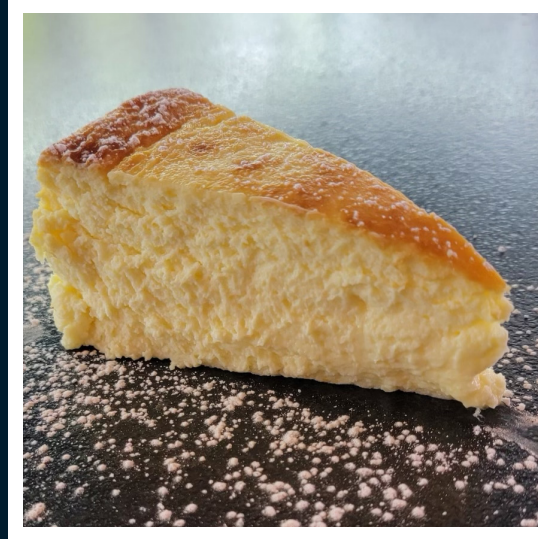
BAVARIAN CREAM CHEESECAKE 9 Crecco's New York Style