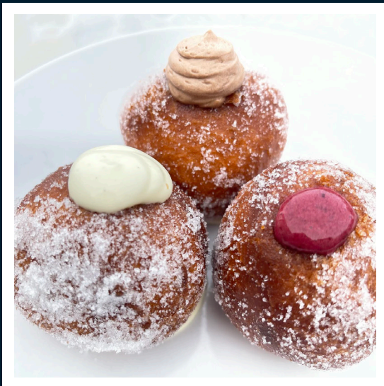
BOMBOLONI 9 Hot Italian Filled Doughnuts, Chocolate, Vanilla, Berry