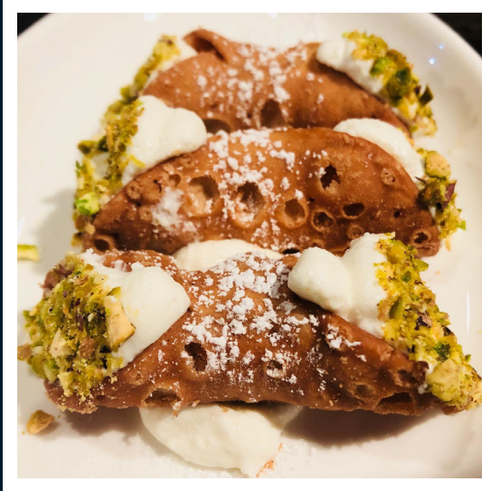
MINI CANNOLIS (3) 8 Housemade Cannoli Cream, Pistachios